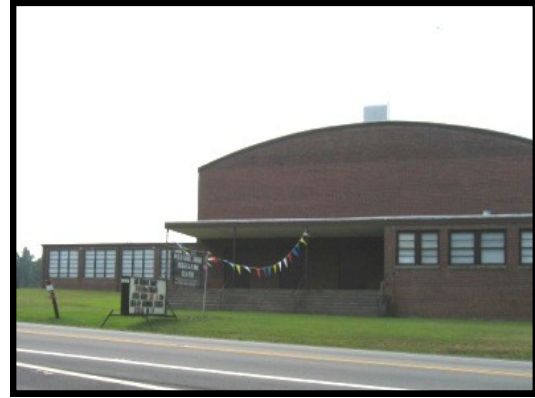
Pleasant Grove Recreation Center 3958 N NC Highway 49 Burlington, NC 27217 (336) 226-1494