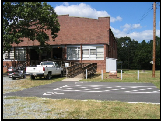
Eli Whitney Recreation Center 4110 E. Greensboro-Chapel Hill Road Graham, NC 27253 (336) 376-6376